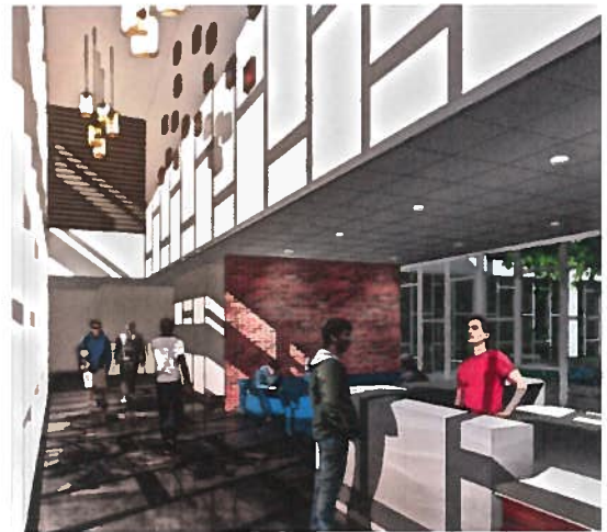
Design Poole & Co. Architects.