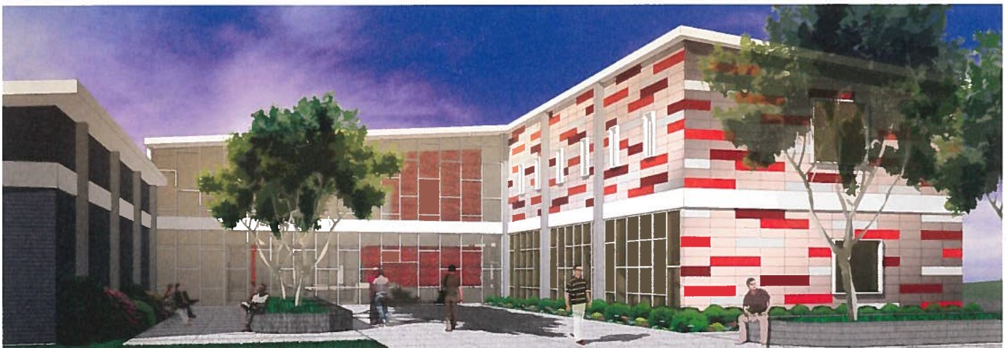
With your help, our new facility will allow us to better serve our community in crisis. Design Poole & Co. Architects.

Access to a gym assists our guests in getting physically healthy.